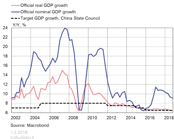
Nominal and real GDP growth rates, 2002Q1–2018Q4

The lack of fluctuations in the real GDP growth rate in recent years is hard to ignore. Figure 1 shows fluctuations in the nominal GDP series after 2012, but almost no volatility