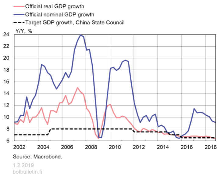
Nominal and real GDP growth rates, 2002Q1–2018Q4

The lack of fluctuations in the real GDP growth rate in recent years is hard to ignore. Figure 1 shows fluctuations in the nominal GDP series after 2012, but almost no volatility