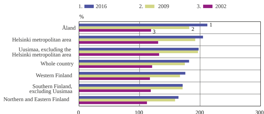
Regional disparity in housing debt relative to income

Housing debt relative to disposable monetary income of households with housing debt. Debt related to housing company loans and investment properties is omitted.